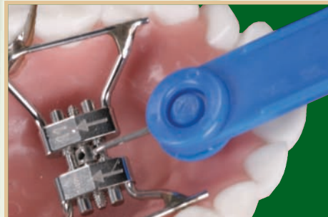
TURNING YOUR EXPANDER